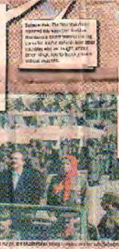
Saddam base: The group has established a network of bases and training camps in Iraq. The rest of the world has been told to stay out of Baghdad and other hotspots.