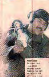
Archipelago of terror These camps, scattered by the Gulf War across Iraq's 20 provinces, harbored the Mujahideen Army base of the Saddam insurgency and the al-Qaeda network.

The Gulf War allies spared the camps of 'pro democracy' Iranian rebels based in Iraq. Now they are concealing Saddam's arsenal of chemical, biological and nuclear weapons, a dissident says.